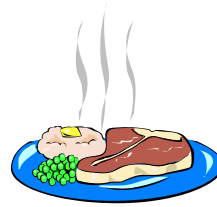
D in ner